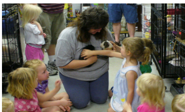
Pet Store Visit