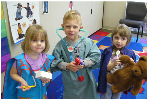
Teddy Bear Clinic